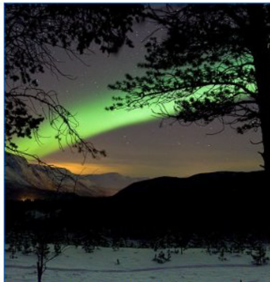
Image credit: Harald Krefthing of Skibottselva, Norway (Feb. 9, 2010)

GEOMAGNETIC STORM WARNING: Over the past few days, active sunspot 1045 has hurled a series of coronal mass ejections (CMEs) toward Earth. These are not the kind of major CMEs that will spark auroras over, say, Florida, but they could spark some very nice lights around the Arctic Circle. (continued below)