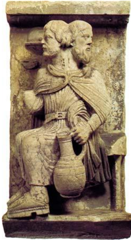
The God Janus

Her knowledge has grown, the same as everyone's knowledge has grown. She didn't come into existence with all that she holds now in her soul. She wasn't exactly a white slate so to speak, an empty chalkboard. There was a great deal of knowledge, a great deal of understanding because that is how she came into existence. But she witnessed the evolution, the expansion, the understanding of the many long ages of Brahma, and what had been accomplished in each age of Brahma; and she saw all that this age of Brahma held in its expanse, in its going forth, and she kept that all within her heart. That is what belongs to that side, that face so to speak, of the crone